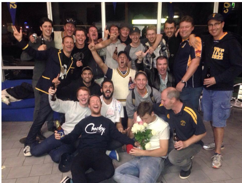
The guys in a quiet moment of reflection after the 1 st and 2 nd Grand Final loses.