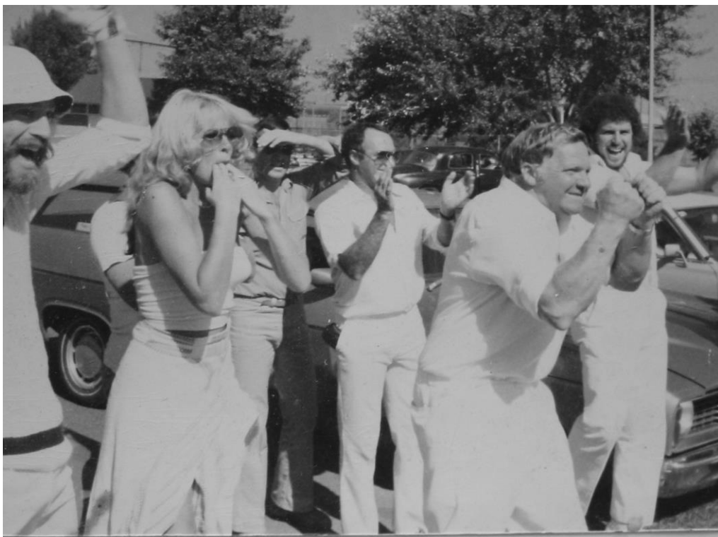
Above: - Rackstraw's Raiders take a first Innings Lead to put YPCC in the box seat to win YPCC's first Premiership in 1979-80