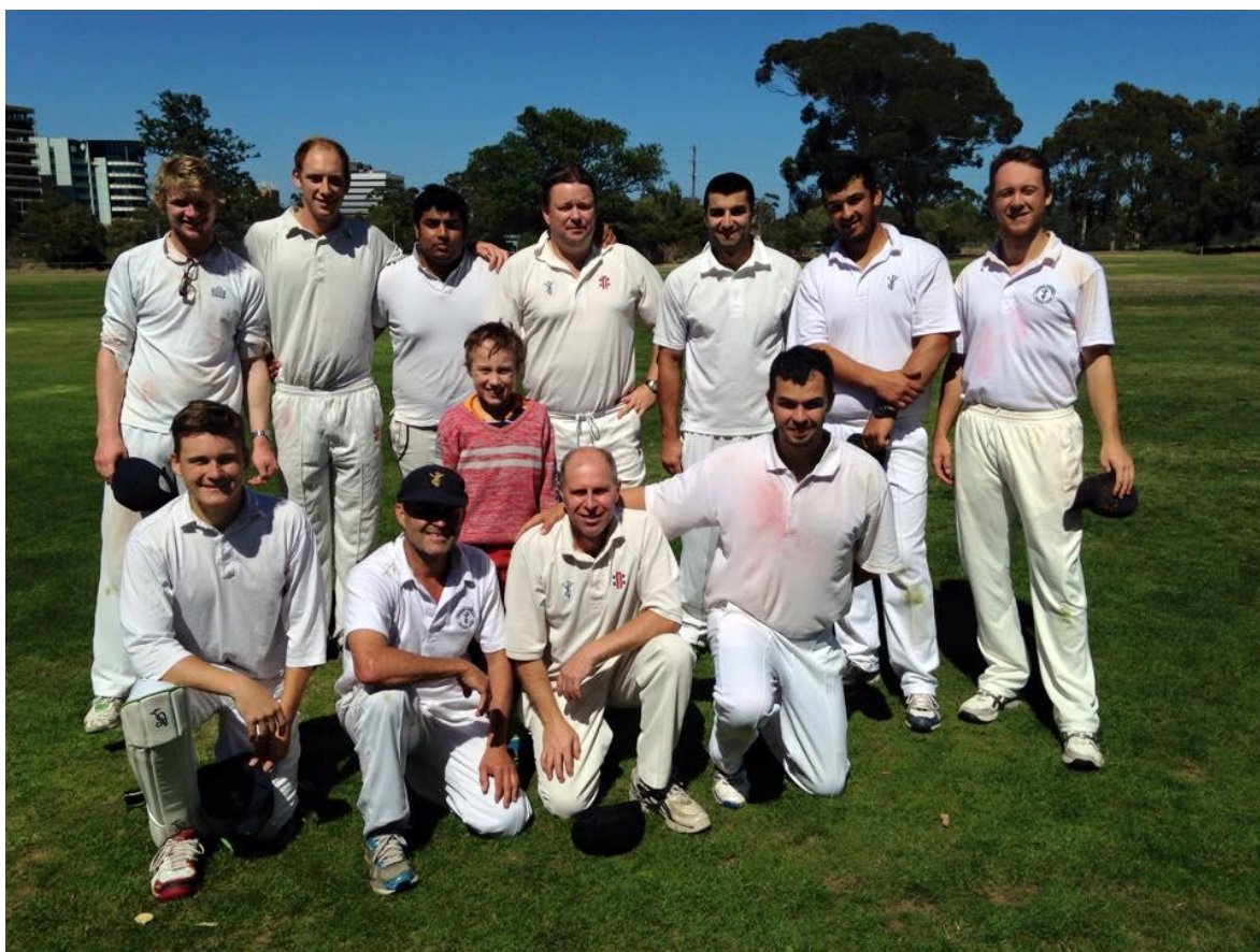
The 2 nd XI team before taking the field against Parkville Districts in the Grand Final.