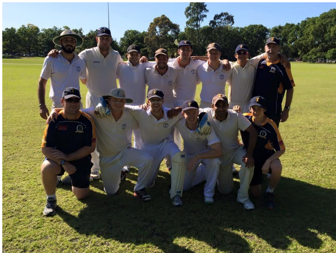
The 1 st X1 team before taking the field against Burnley CYMS in the Grand Final.