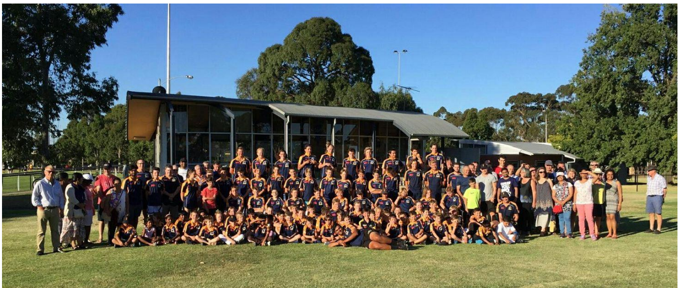
Just some of the up and coming Juniors of YPCC.