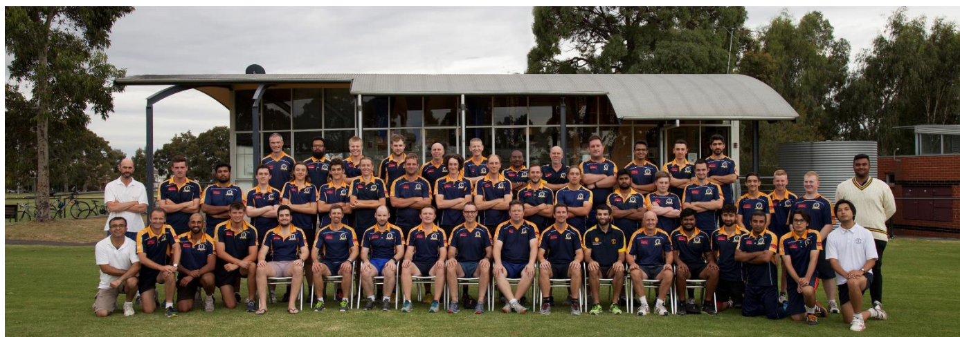
Just some of the 2017-18 Senior Playing List.