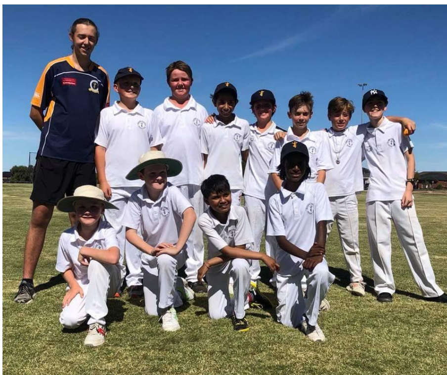
The Under 12B(1) team bowed out in the quarter finals this season.