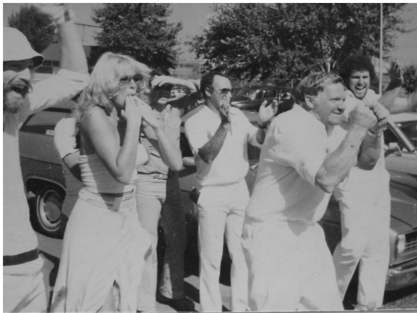
Above: - Rackstraw's Raiders take a first Innings Lead to put YPCC in the box seat to win YPCC's first Premiership in 1979-80