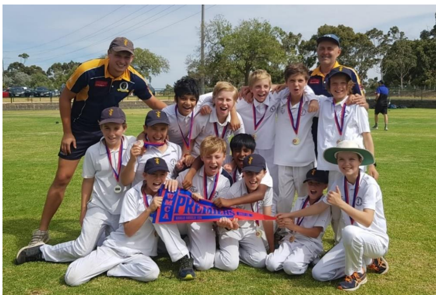
The Under 12A Premiership team. They went through the season undefeated!