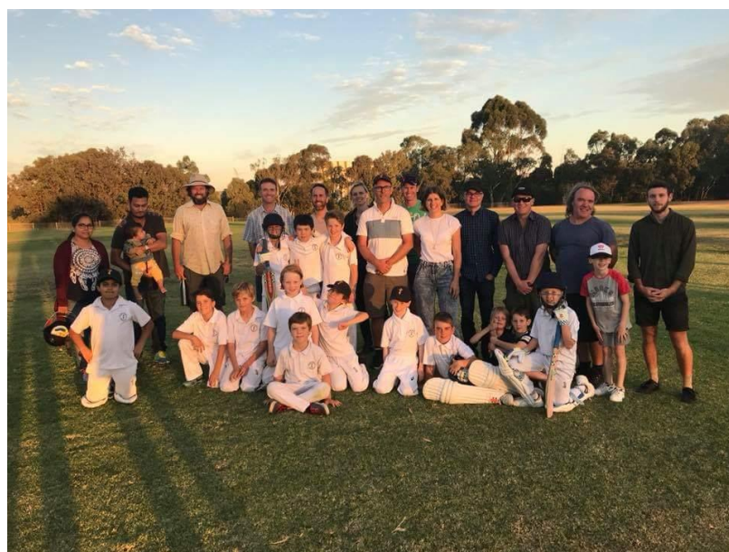
The Friday evening Under 12 team bowed out in the quarter finals.