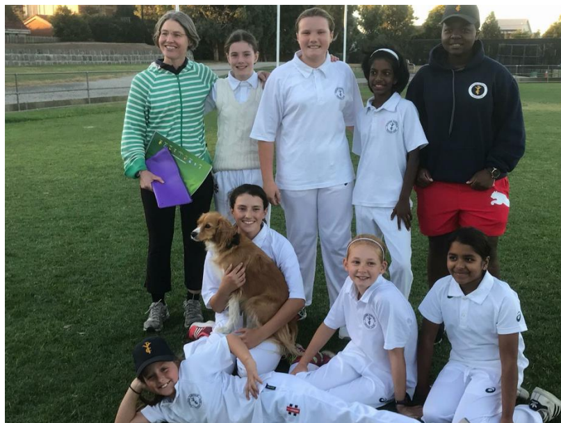
Under 13 Girls. YPCC's first all girls team. They were beaten semi finalists.