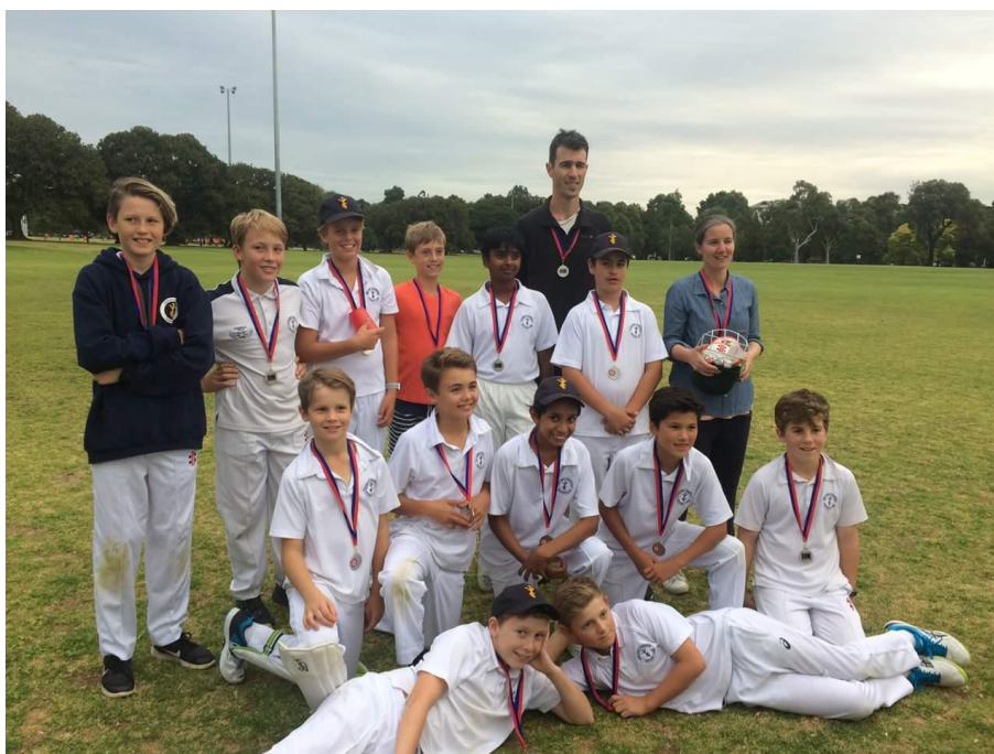
The Under 14B team were runners up in 2017-18.