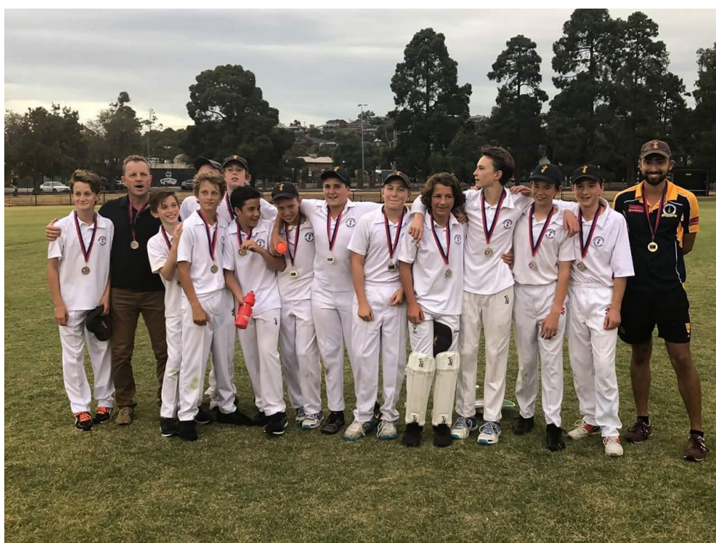
The Under 14A team were runners up in 2017-18.