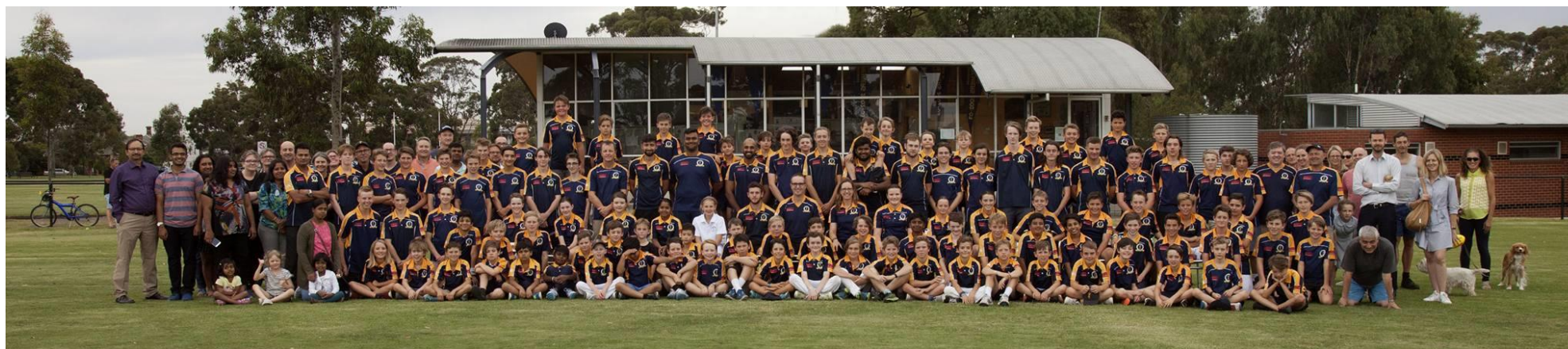
Just some of the Junior Players and supporters for the 2017-18 season.

# Indicates a GF, ^ Denotes a Preliminary Final, § Denotes a Semi Final