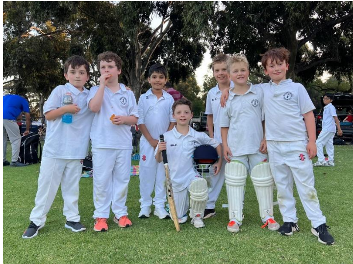
The under 10 Blue team.