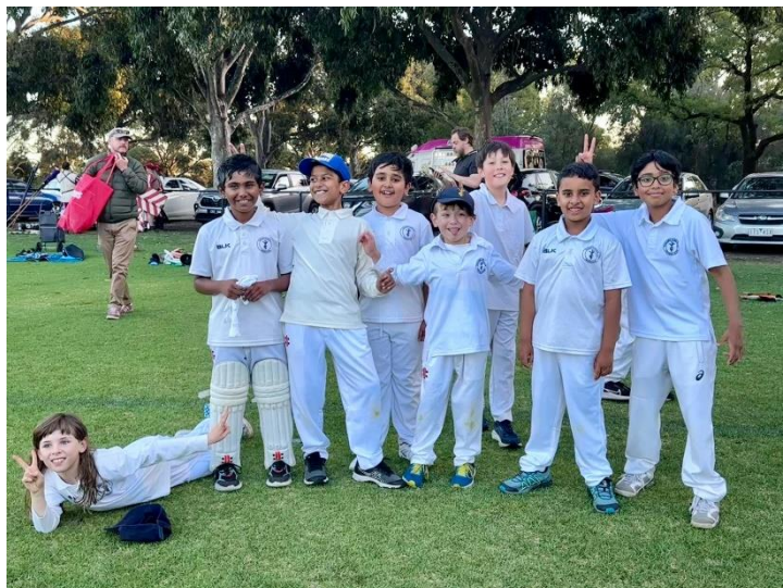
The under 10 Owls team.