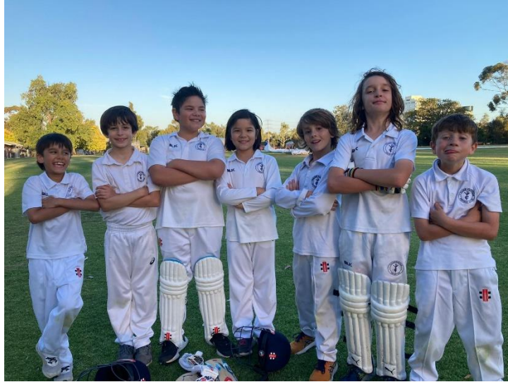
The under 10 Gold team.